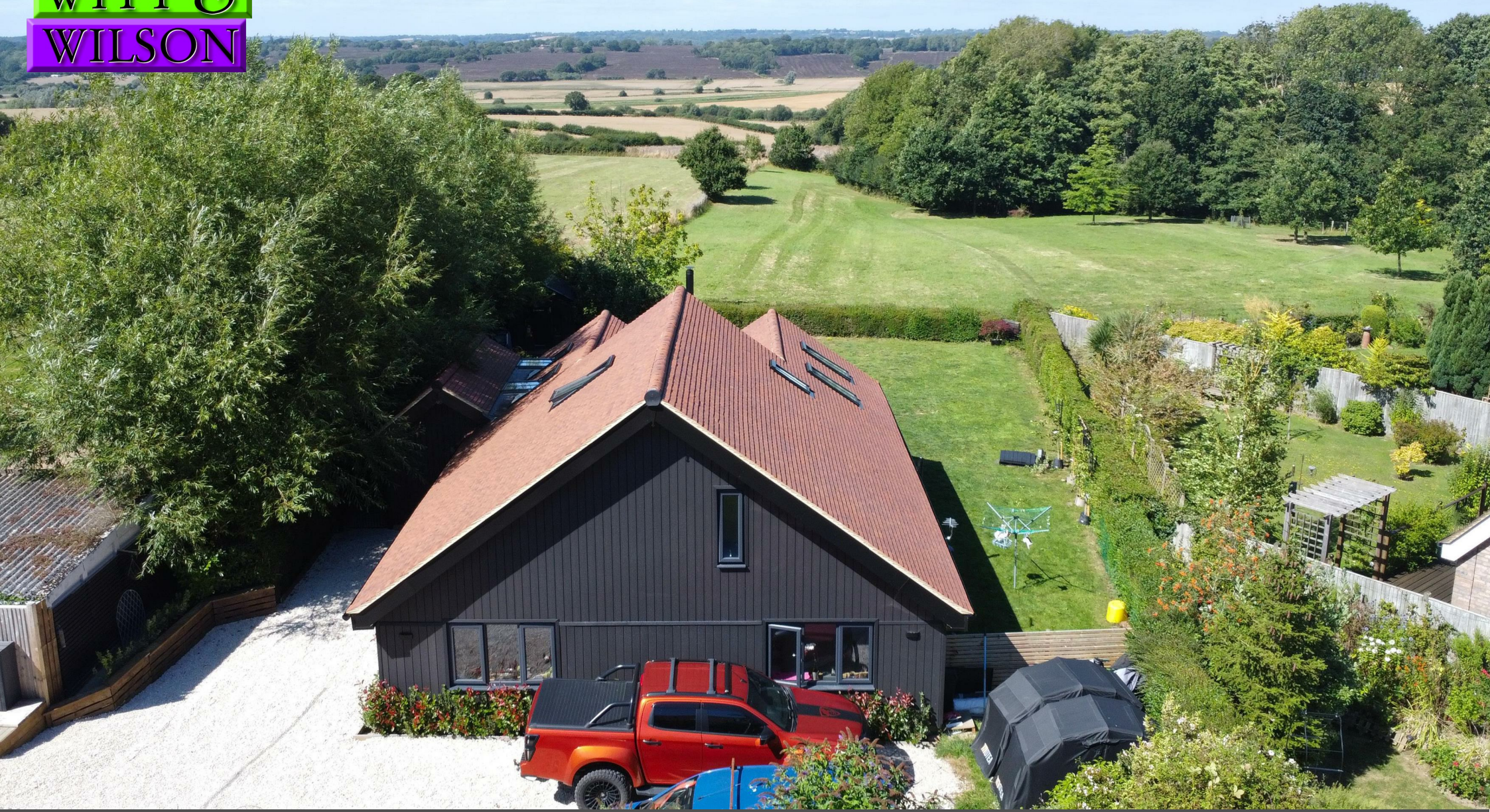
New Barn, Station Road, Northiam, East Sussex, TN31 6QL. Guide Price £675,000 Freehold